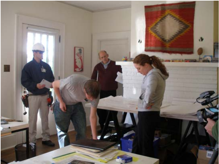
The interior of Maggie's house is actually a house-turned-architect's office